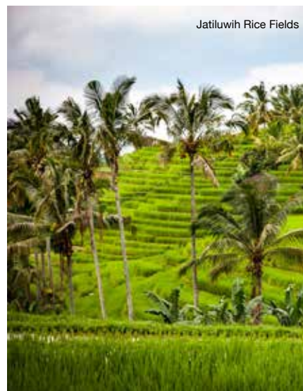
Jatiluwih Rice Fields

Jatiluwih, recognised as a World UNESCO site is still under the tourists radar. The accessibility of this region keeps the Kuta and Canggu crowd away. Make sure you make your way there before the next Bali swing is built!